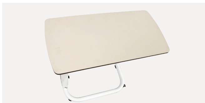
Table top is made of phenolic resin laminate with PVC cover.