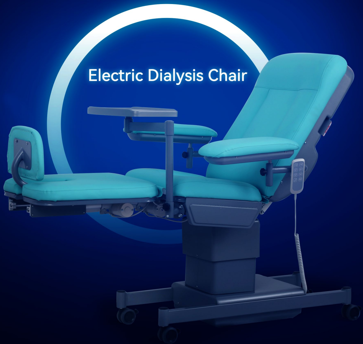
Electric Dialysis Chair